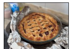
Homemade Rhubarb Pie (a rarity)

Thank you all for your prayers and financial support in this church planting ministry.