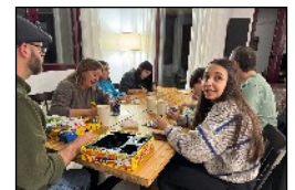
Telestrations is an all time favorite