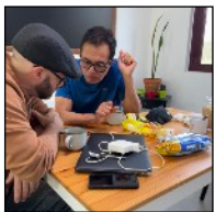
Conversations around the table