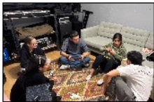
Dominoes and a cookout